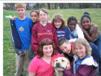
A few students and a volunteer pooch at the Walkathon.