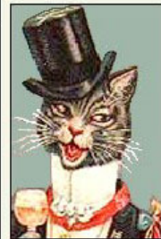
Spay and Neuter

WRITE CHECKS TO PCHS, MAIL TO PO BOX 1046, DUBLIN, VA 24084