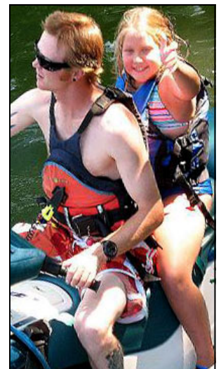
THUMBS UP at the PCHS Summer Volunteer Party at Claytor Lake.