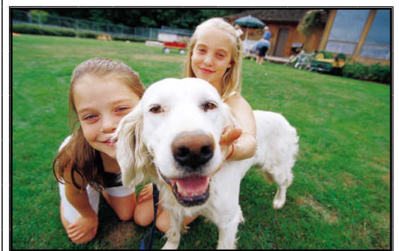
PCHS applauds Radford Animal Hospital for organizing and hosting the 1st Annual "Pets on Parade" Walkathon October 7th at Bisset Park in Radford.

or walk a shelter dog and enjoy a beautiful day at the park while raising funds to benefit the PCHS and Pound Pals of Radford. Sponsor signup forms can be picked up at our shelter,